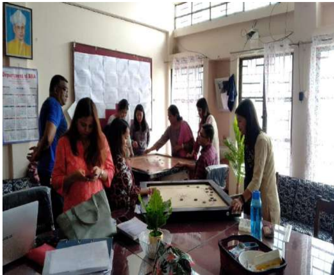
Some of the Photos of the Events