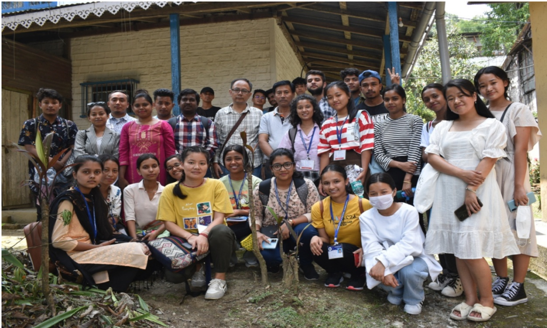
Students in front of the processing unit