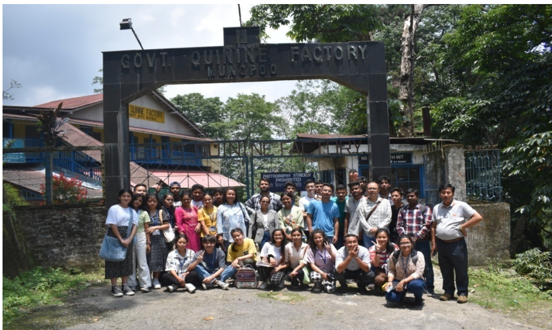
Students in front of the main gate